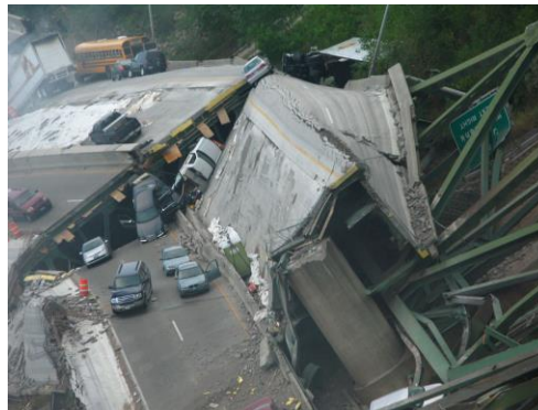
Figure 2: The collapse of 35W bridge on August 1, 2007 [7].