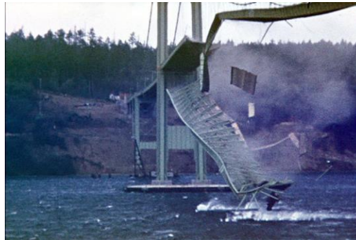
Figure 1: The collapse of Tacoma Narrows bridge on November 7, 1940 [6].